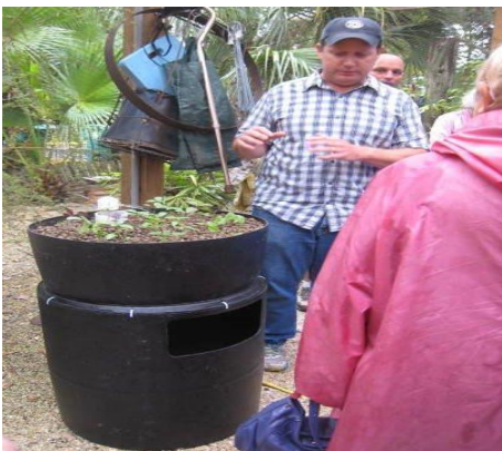
Demonstrating SS. Eco System – save money, eat well, live healthy Alternative custom growing systems