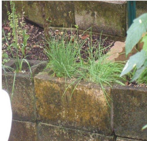
Herbs growing in cinderblock