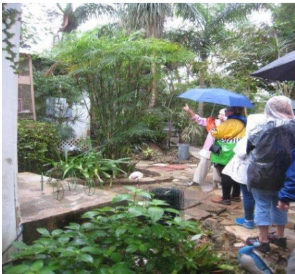
A damp & rainy tour begins