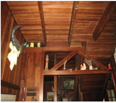
Inside of 1899 first farmhouse in Homestead, FL. Note the stone and mortar fireplace and interior Miami-Dade slash pine and stone walls.