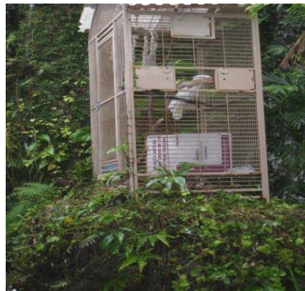
White Cockatoo showing off on his trapeze – unbelievable!