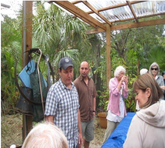
Workshop taking place in growing rooms